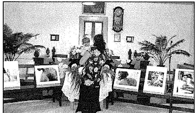
Photos from the book were displayed beautifully at the Ruatonga Meeting House